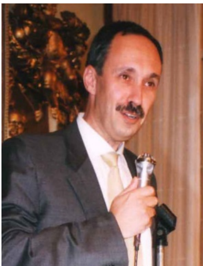
1997 EACWE2 in Genova

He seemed to have hastened to his death, leaving this great classic for us.