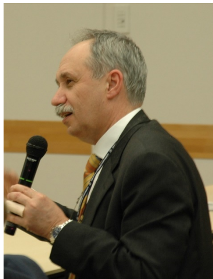
2008 ISWE3 in Tokyo